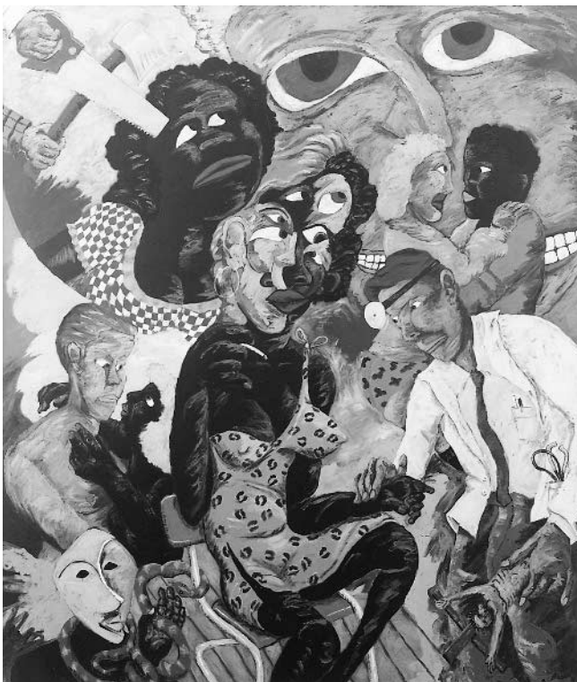
19. Grandma and the Frenchman (Identity Crisis) (1990) by Robert Colescott.

And doesn't the expression of personal identity demand an imposed narrative and a realist mode?