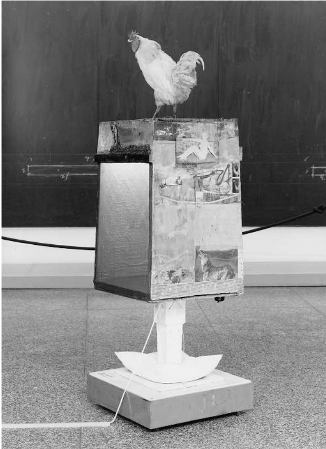
21. Odalisk (1955–8) by Robert Rauschenberg. 'Image leads to relativism leads to doubt.' Then what is the bird doing on top of it all?