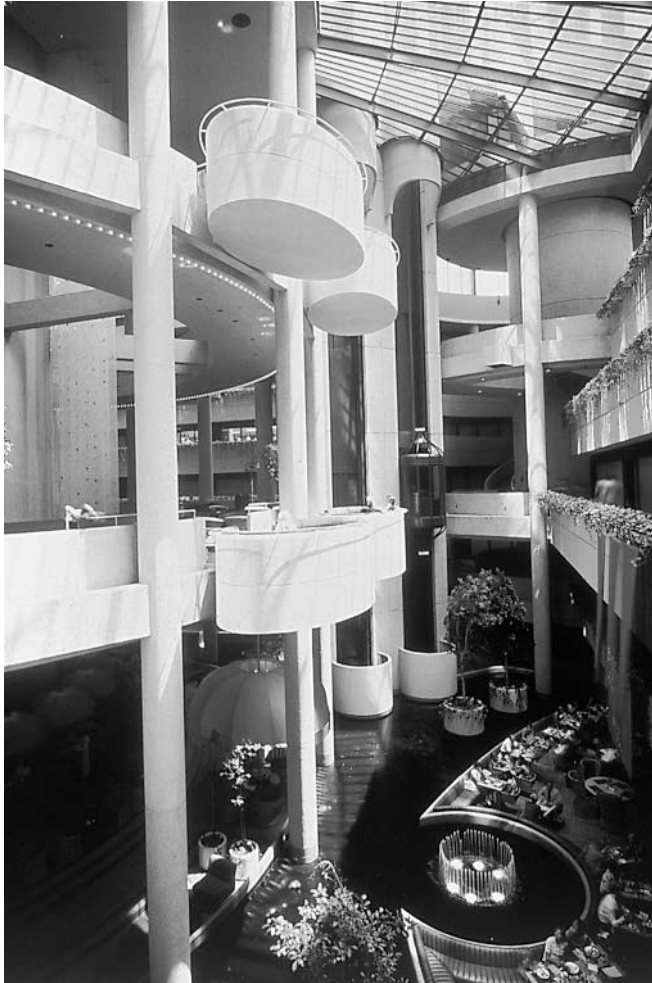
1. Interior of Westin Bonaventure Hotel by Portman. 'Postmodernist hyperspace'.