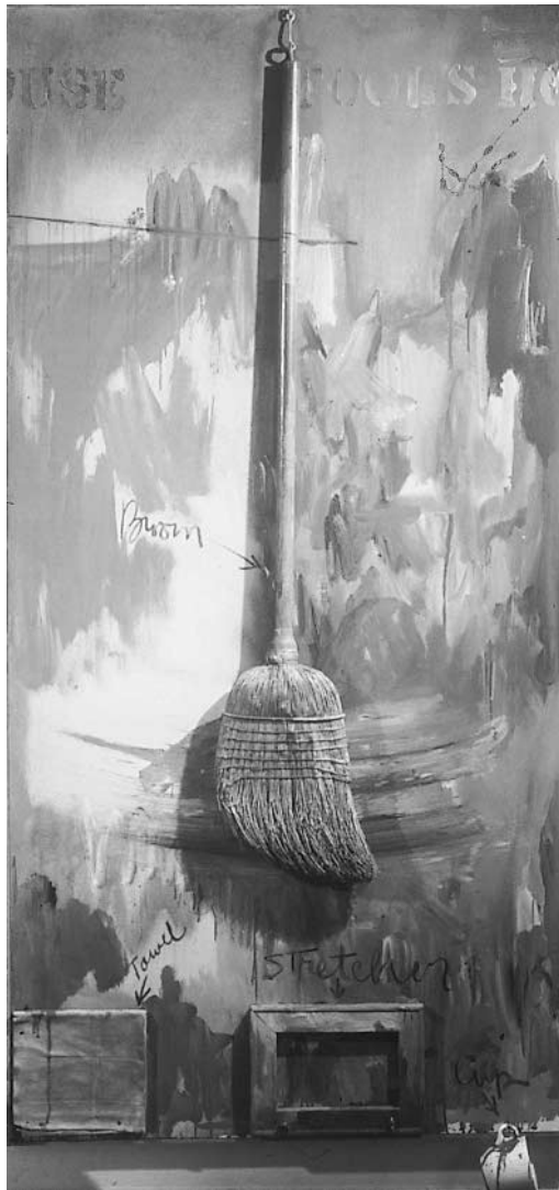
5. Fool's House (1962) by Jasper Johns. Language, theory, the object, and art. Is this a paint brush?