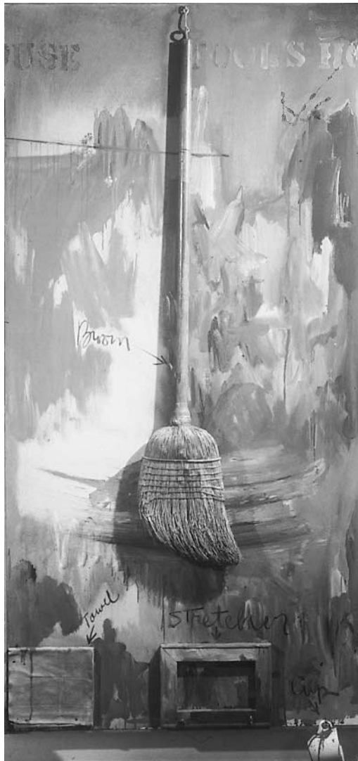
5. Fool's House (1962) by Jasper Johns. Language, theory, the object, and art. Is this a paint brush?