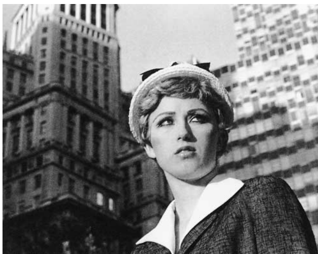
3, 4. Untitled film still (1977) by Cindy Sherman. Cindy Sherman as Hitchcock or as Antonioni might have seen her; but didn't.