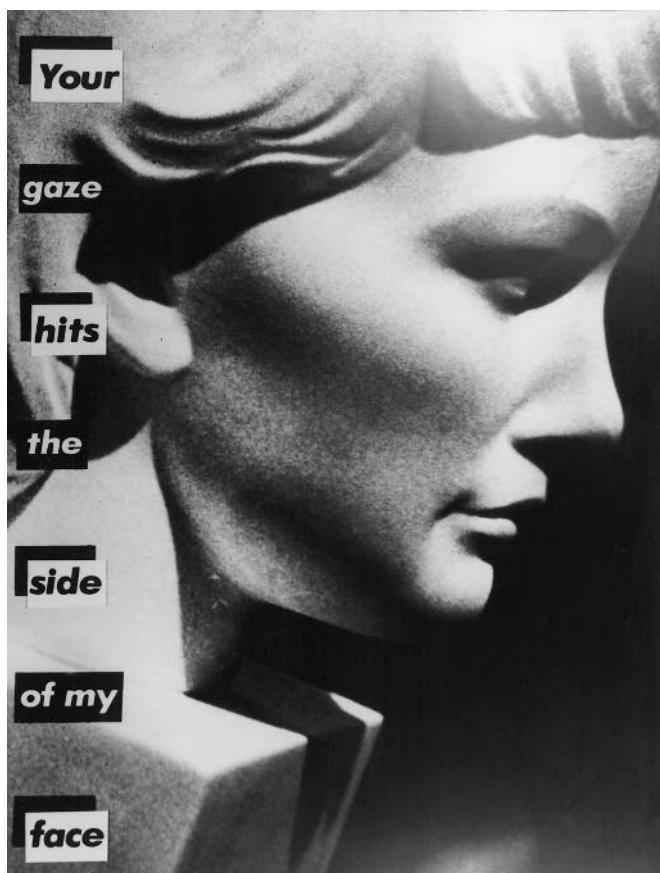
17. Untitled (Your gaze hits the side of my face) (1981) by Barbara Kruger. Art with a message: how violent is the male gaze?