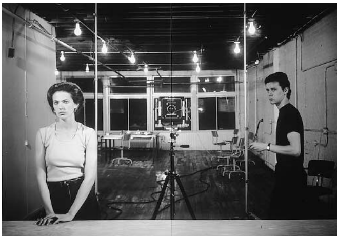
11. Picture for Women (1979) by Jeff Wall. Who looks at whom, at what angle, and why?