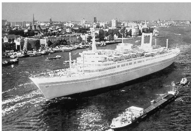
7. SS Amsterdam in Front of Rotterdam (1966) by Malcolm Morley. Is this just a big ship, or a statement about the nature of art?

Many modernist works aimed at a kind of self-explanatory autonomy ('all you need to understand' Four Quartets , in particular,