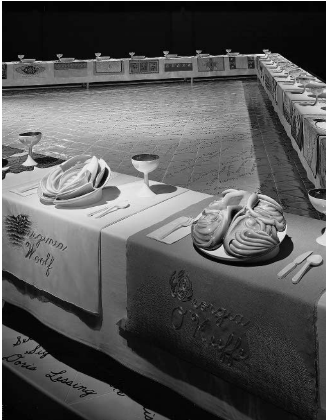
14. The Dinner Party (1979) by Judy Chicago. A feminist symposium: but are the identities of the participants constrained by the imagery used to 'represent' them?