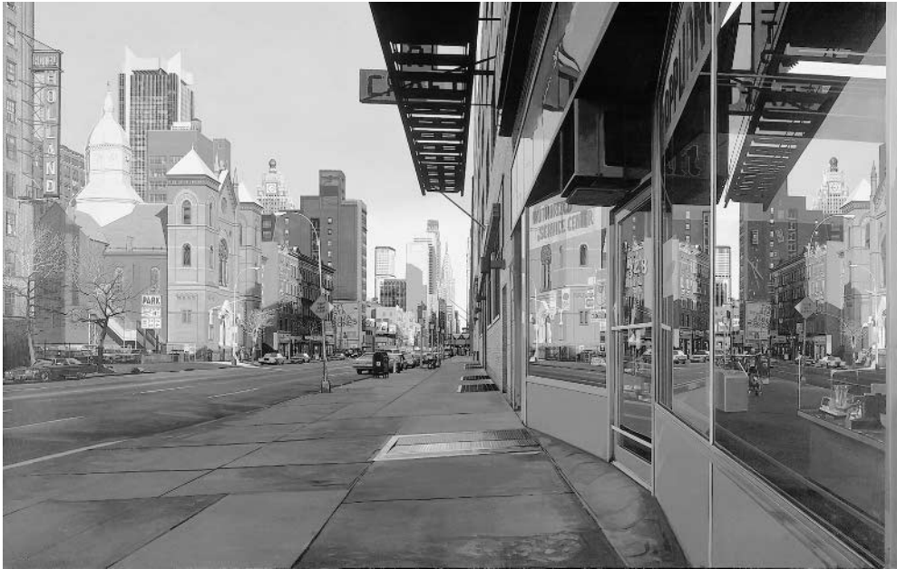
8. Holland Hotel by Richard Estes. A dangerous formal beauty, retrogressively modernist?