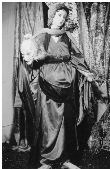
16. Untitled, #228 (1990) by Cindy Sherman. Acting out and the threat of castration: is Judith's story also Cindy Sherman's?