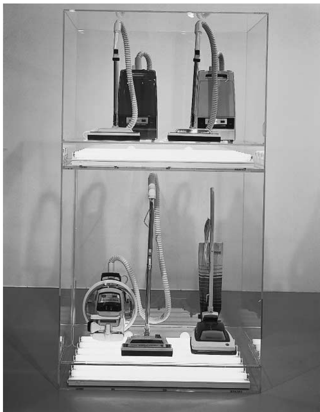
6. New Hoover Quadraflex (1981-6) by Jeff Koons. The fine art of museum display is applied to ordinary consumerist objects.