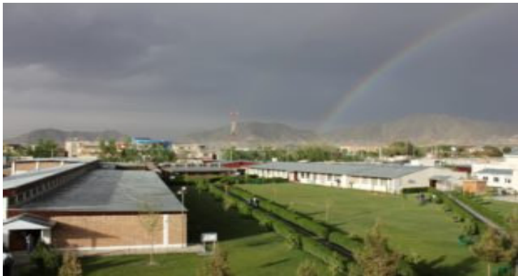
American University of Afghanistan