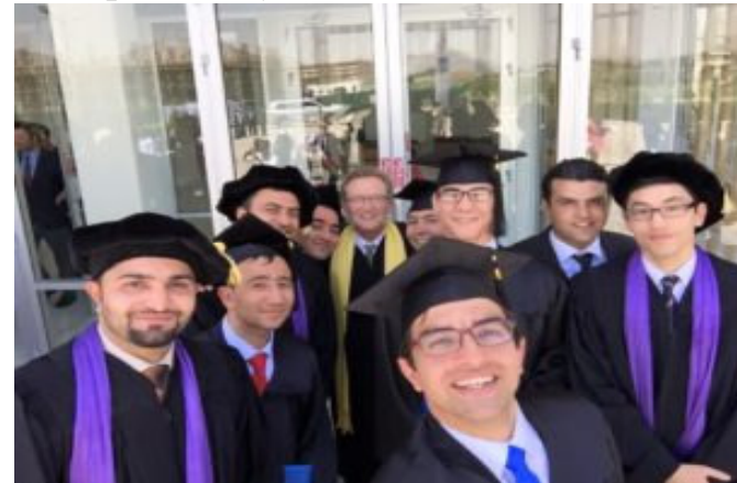
AUAF 2016 Graduation

about the future of the country — cannot back down to insurgents and criminals who threaten a future of possibility.”