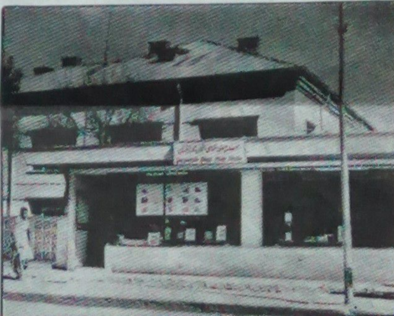
Photo studios of the Union.