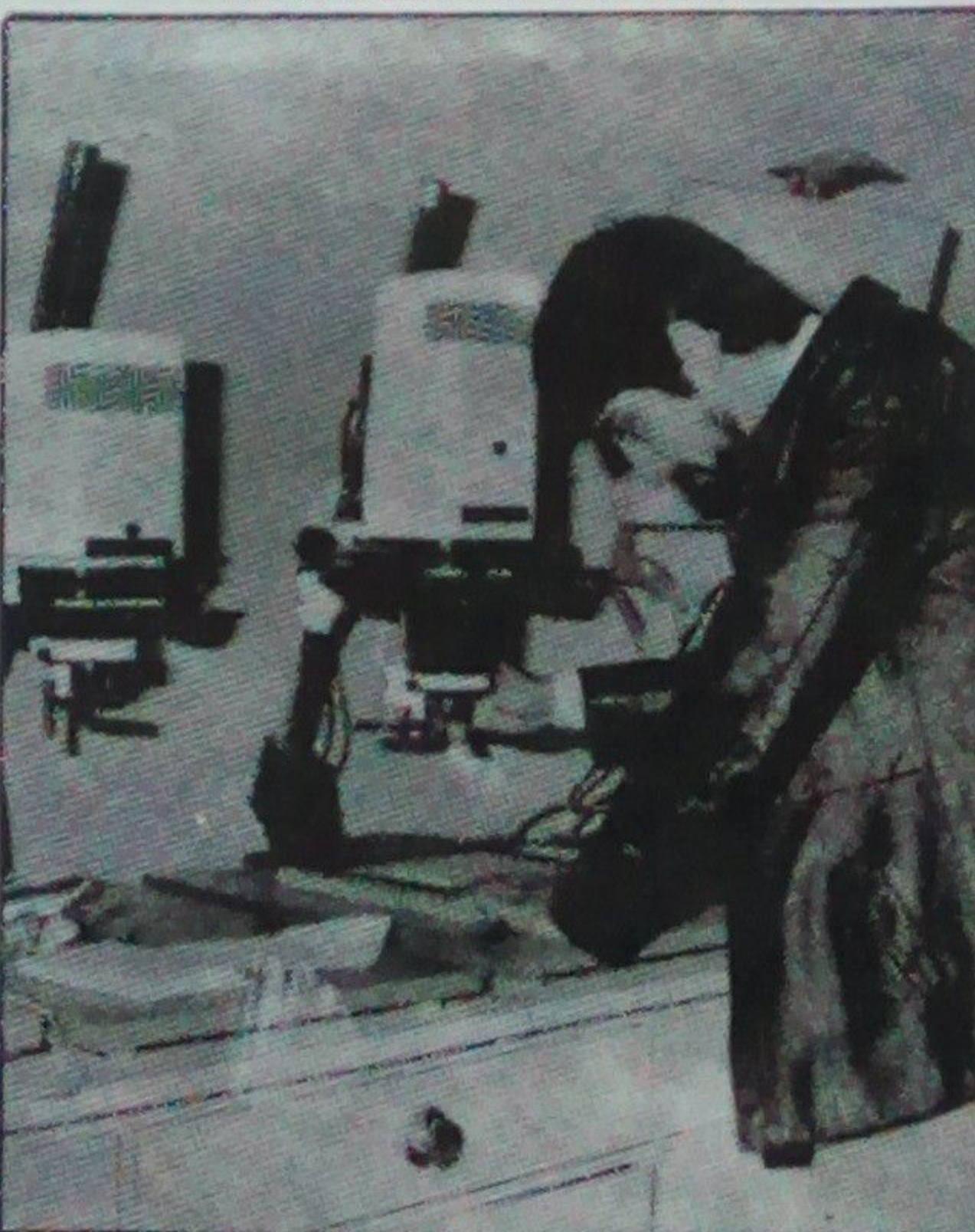
Headquarters of Journalists' Union.