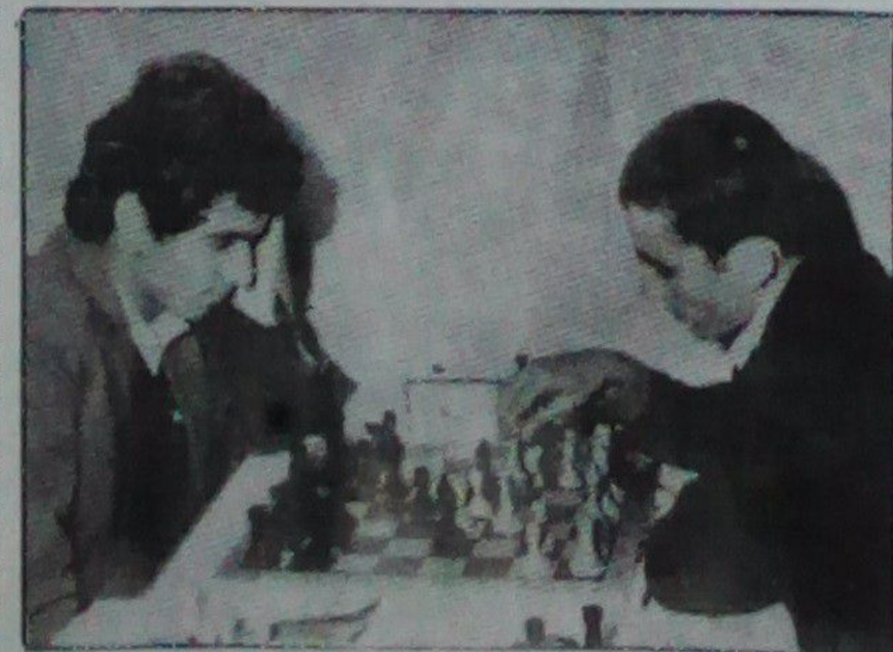
A chess match is progress in the Chess Central Club.

They or their authorised representatives should attend the bidding on April 1, 1987, which is the last day for bidding. Specifications and conditions can be obtained. Bidbond is necessary. (182) 2-2