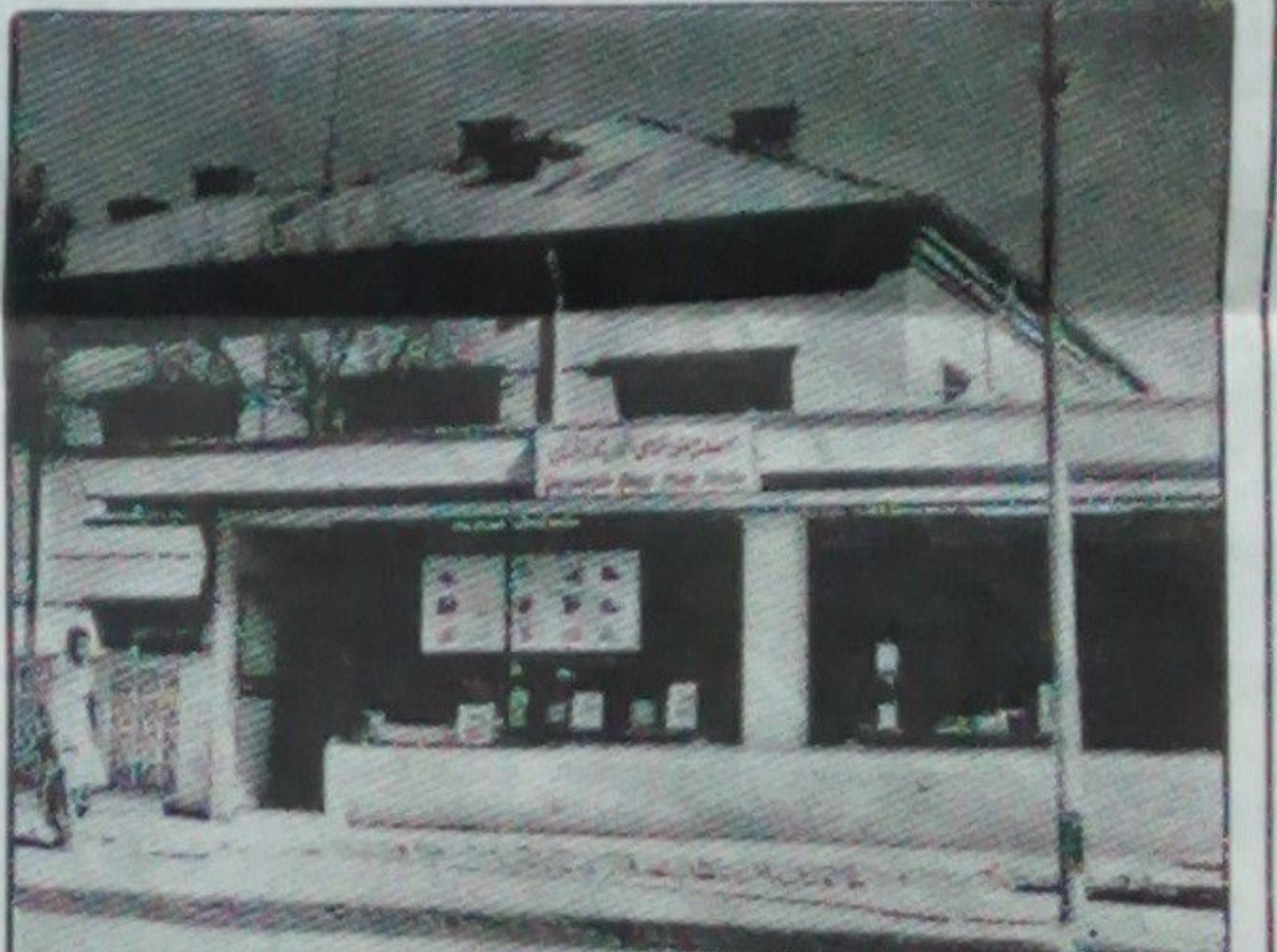
Photo studios of the Union.