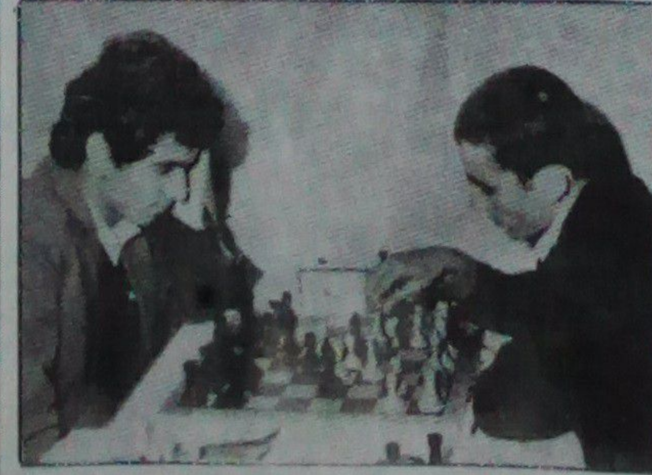
A chess match is progress in the Chess Central Club.